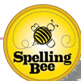
The Doncaster Spelling Bee champion

We had a special visitor this week and Friends of Copley created a fabulous Easter trail for children to enjoy followed by an Easter treat. Thank you to the Friends of Copley team who led this and the Mothers' and Others' Day Gift shop this month.